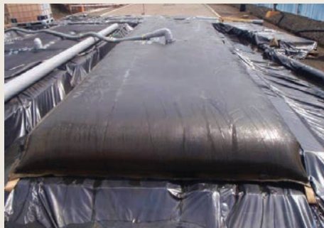
Dewatering of oil sludge

Through continuous or event driven pond maintenance dewatering programs to insure sufficient capacity, TenCate Geotube® dewatering and containment technology provides a simple, low cost solution. Easy to set up, even in remote locations, TenCate Geotube® dewatering technology can quickly be deployed to reduce lagoon levels or be used to contain the full volume of dewatered waste material for a complete cleanout.