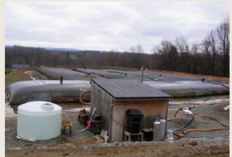
Geotube® dewatering cell