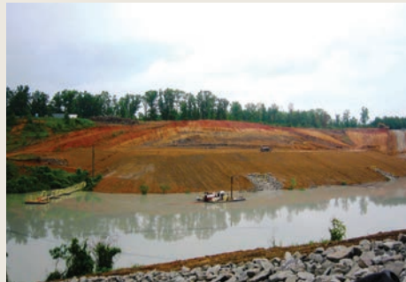
Reclaimed site after dewatering