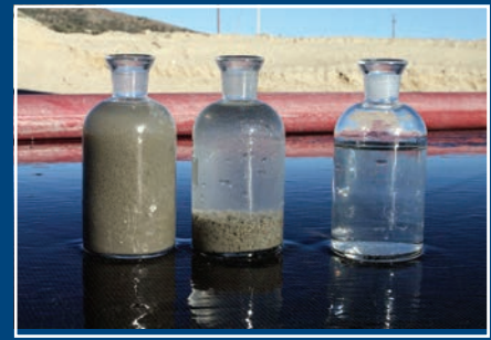
Sludge before (left) and after (right) treatment with Geotube® dewatering technology.

TenCate Geotube® containers can be custom-sized to fit available space and be easily removed when dewatering is complete. Dewatered solids can be safely stored on site, re-utilized to build dykes and berms, or disposed of in a landfill without expensive dredging or transportation.