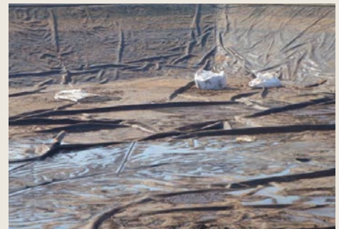
Pond empty for HDPE liner repair