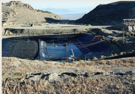
Barren and pregnant ponds

By capturing and containing valuable metals using TenCate Geotube® containers, the expense of treating mine waste can be offset and become a valuable income stream.