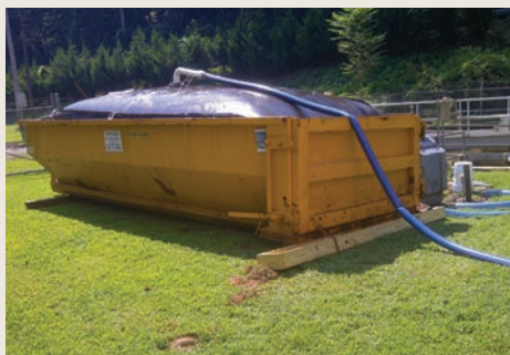
Geotube® Mobile Dewatering System

TenCate Geotube® dewatering and containment technology is a simple, low tech solution ideal for remote or highly industrialized locations. TenCate Geotube® containers can be customized in size and shape to meet almost any need. Whether an individual Geotube® unit is required to fit into an underground gallery, or multiple, large tubes need to be stacked above ground to accommodate large volumes within a specific footprint; whatever the situation, TenCate can customize a dewatering solution right for you