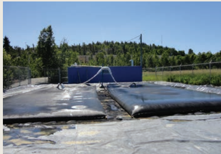
Closed loop process for drilling water management

The specially engineered TenCate Geotube® textile retains the solids while releasing the clear water through the pores of the fabric. The effluent is typically of a quality that can be reused for mine processing operations, making this an economical and sustainable technology for mine water management.