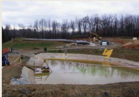
AMD sediment pond

The treatment process of an AMD waste with TenCate Geotube® dewatering technology is accomplished through the containment and dewatering of the precipitated solids. The dewatered solids can then be safely and economically disposed in an approved landfill site thus eliminating an environmental problem.