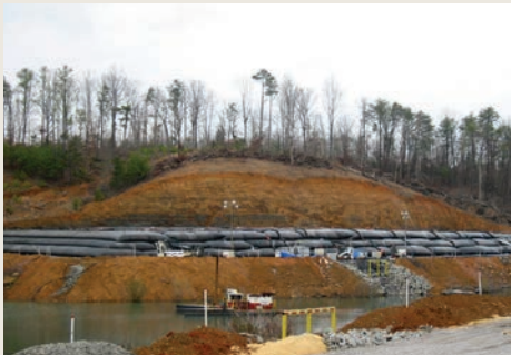
Dewatering of waste slurry

Whether it be a natural disaster, a catastrophic event affecting tailing ponds, permit restrictions, interruptions of mechanical dewatering processes, above or underground capacity limitations, or sudden increase in slurry production that strains the existing dewatering facility, TenCate Geotube® containers, in a variety of sizes to fit almost all situations, are readily available to restore tailings operations.