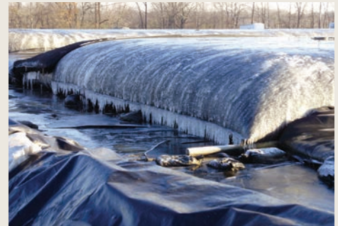
Dewatering under winter conditions